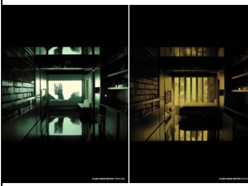
Gary Chang EDGE Design Institute Ltd.

simple structure was built by local craftspeople with local resources, and develops the concept of sustainability.