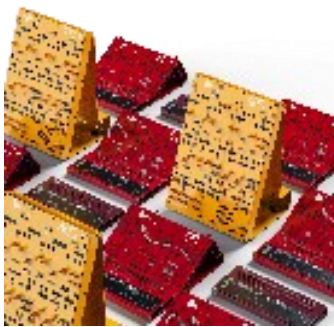
Teenage Engineering (Sweden)