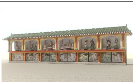
Haw Par Music (Hong Kong)

The exhibition will feature the 1:150 models of Shek Lei Playground, Sheung Shing Street Park and Ping Shek Estate Playground.